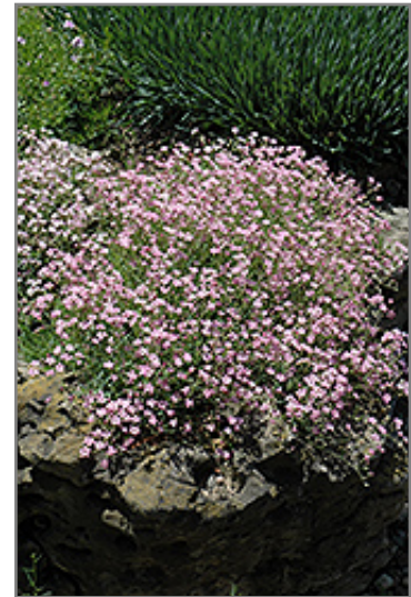
Pink Creeping Baby's Breath in bloom