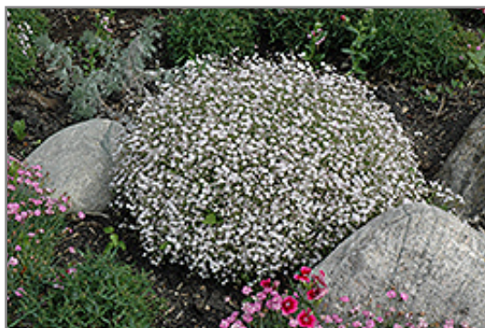
Creeping Baby's Breath in bloom