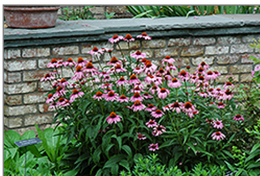
Magnus Coneflower in bloom