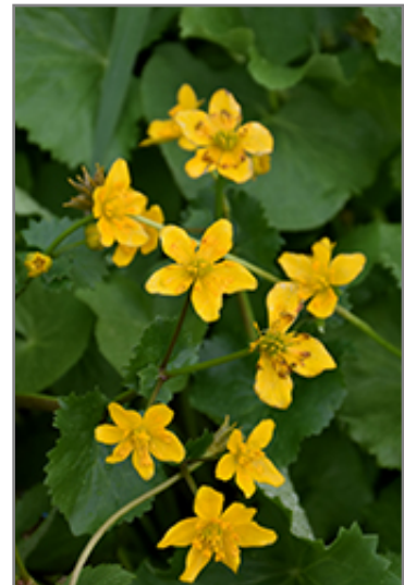
Marsh Marigold flowers