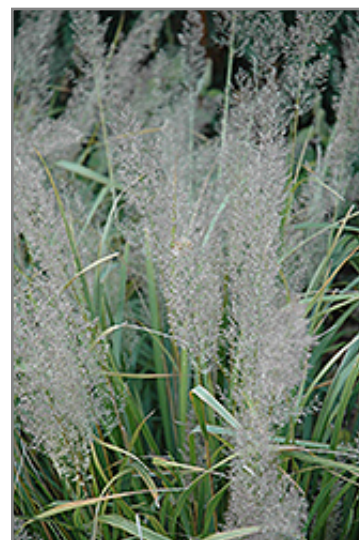
Korean Reed Grass fruit