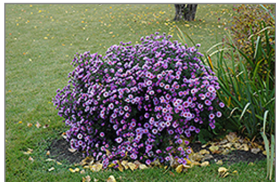
Purple Dome Aster in bloom