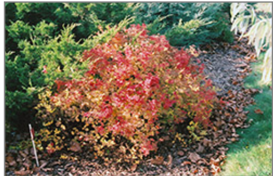
Golden Princess Spirea in fall

Golden Princess Spirea will grow to be about 3 feet tall at maturity, with a spread of 4 feet. It tends to fill out right to the ground and therefore doesn't necessarily require facer plants in front. It grows at a fast rate, and under ideal conditions can be expected to live for approximately 20 years.