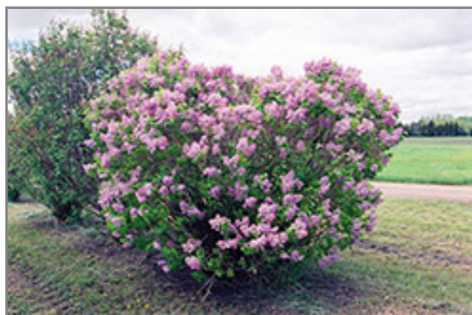
Hippolyte Maringer Lilac in bloom