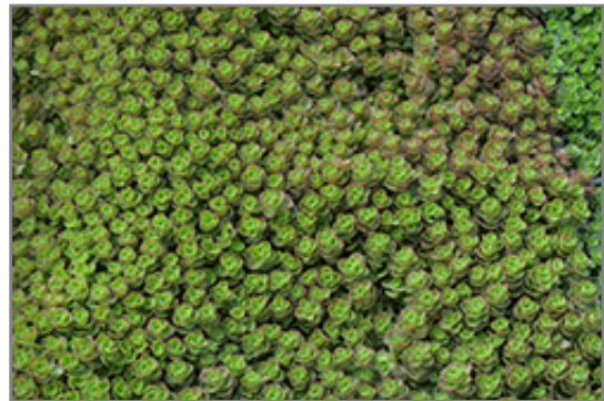
Dragon's Blood Stonecrop foliage