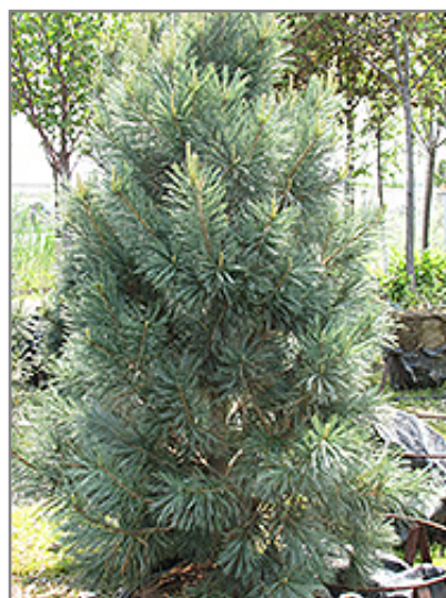
Vanderwolf's Pyramid Pine