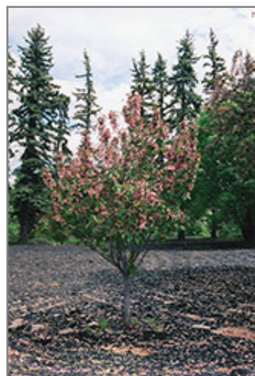
Shaughnessy Cohen Flowering Crab in bloom