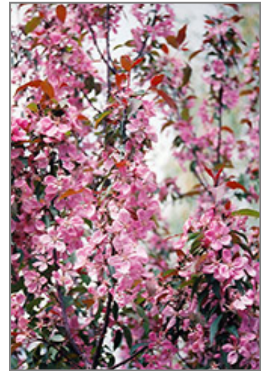
Shaughnessy Cohen Flowering Crab flowers