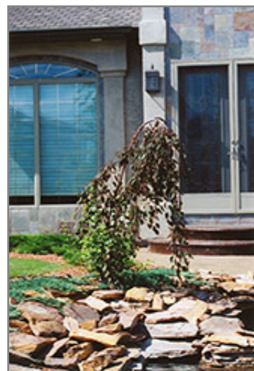
Royal Beauty Flowering Crab