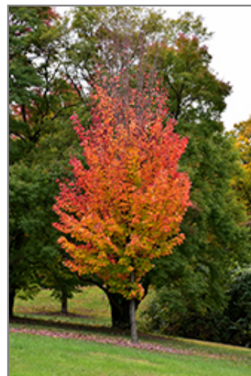
Red Rocket Red Maple in fall

Red Rocket Red Maple is recommended for the following landscape applications;