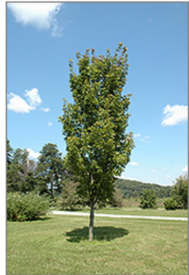
Red Rocket Red Maple

* This is a 'special order' plant - contact store for details