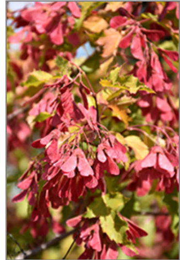
Amur Maple (tree form) fruit

This tree does best in full sun to partial shade. It is very adaptable to both dry and moist locations, and should do just fine under average home landscape conditions. It is not particular as to soil type or pH. It is highly tolerant of urban pollution and will even thrive in inner city environments. This is a selected variety of a species not originally from North America.