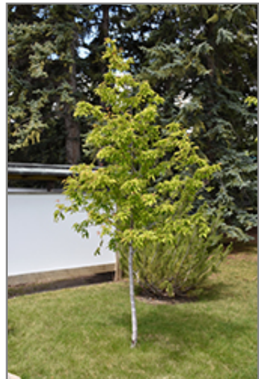
Amur Maple (tree form)