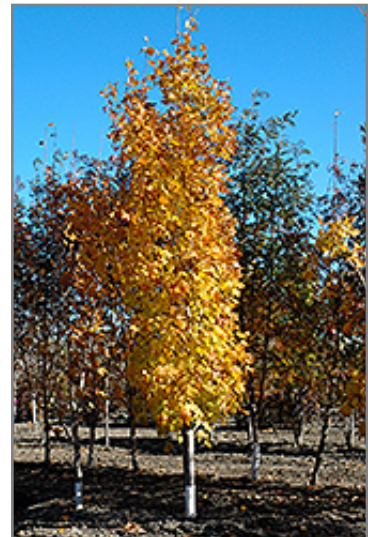
Lord Selkirk Sugar Maple in fall