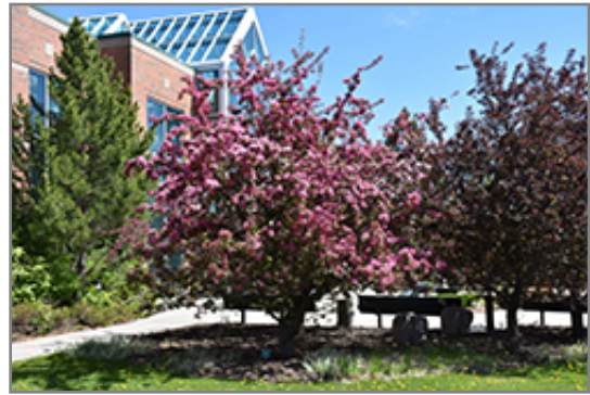
Makamik Flowering Crab in bloom