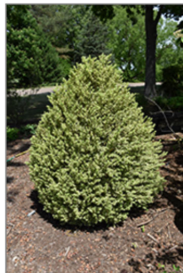
Variegated Boxwood