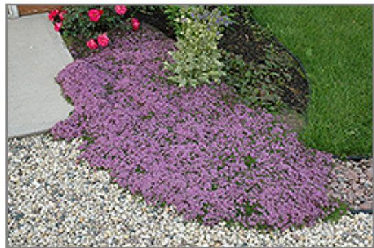
Red Creeping Thyme in bloom