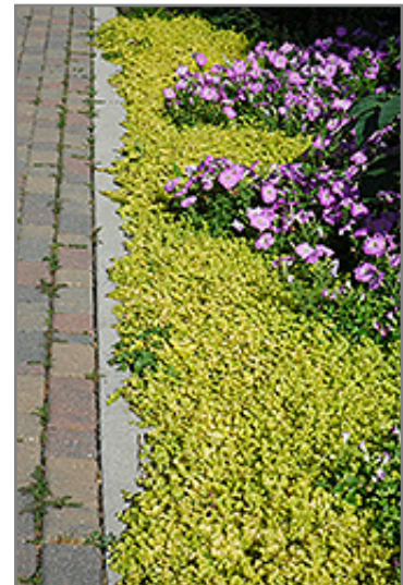
Golden Creeping Jenny