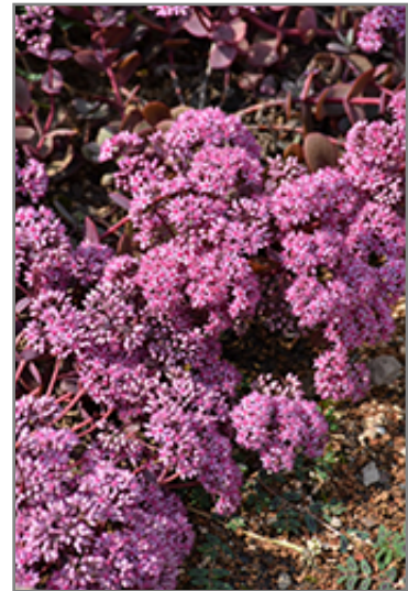
Cherry Tart Stonecrop flowers

Cherry Tart Stonecrop is a fine choice for the garden, but it is also a good selection for planting in outdoor pots and containers. It is often used as a 'filler' in the 'spiller-thriller-filler' container combination, providing a mass of flowers and foliage against which the larger thriller plants stand out. Note that when growing plants in outdoor containers and baskets, they may require more frequent waterings than they would in the yard or garden. Be aware that in our climate, most plants cannot be expected to survive the winter if left in containers outdoors, and this plant is no exception. Contact our experts for more information on how to protect it over the winter months.