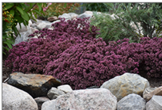
Cherry Tart Stonecrop in bloom

Cherry Tart Stonecrop is a dense herbaceous perennial with an upright spreading habit of growth. Its medium texture blends into the garden, but can always be balanced by a couple of finer or coarser plants for an effective composition.