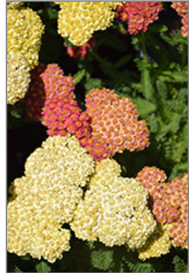
Desert Eve Terracotta Yarrow flowers

Desert Eve Terracotta Yarrow is recommended for the following landscape applications;