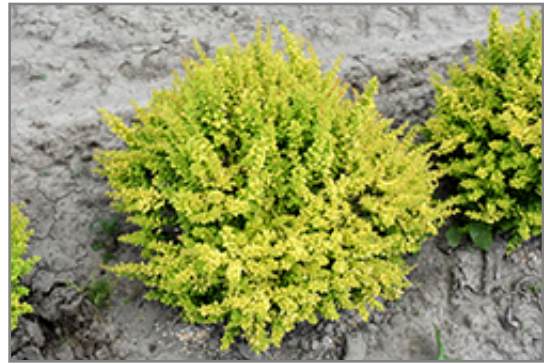
Sunsation Japanese Barberry