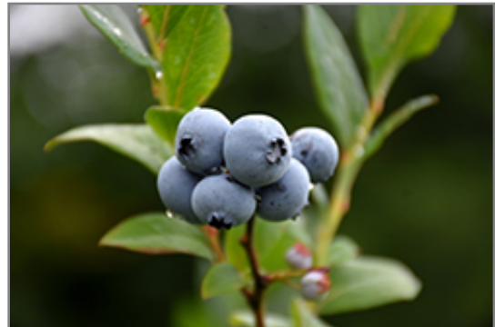
Northsky Blueberry fruit

Northsky Blueberry features dainty clusters of white bell-shaped flowers with shell pink overtones hanging below the branches in mid spring. It has green deciduous foliage. The glossy oval leaves turn an outstanding scarlet in the fall. It features an abundance of magnificent blue berries in mid summer.