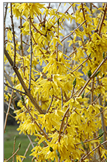
Northern Gold Forsythia flowers