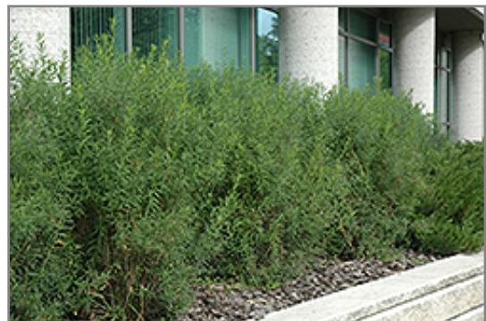
Dwarf Turkestan Burning Bush