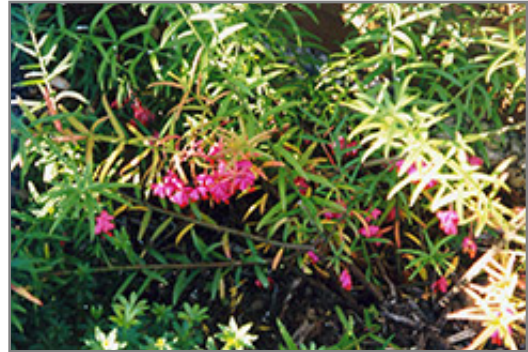
Dwarf Turkestan Burning Bush flowers

This shrub performs well in both full sun and full shade. It is very adaptable to both dry and moist locations, and should do just fine under typical garden conditions. It is not particular as to soil type or pH. It is highly tolerant of urban pollution and will even thrive in inner city environments. This is a selected variety of a species not originally from North America.