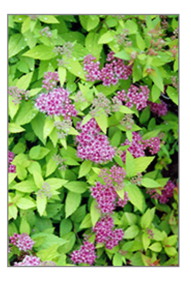
Dakota Goldcharm Spirea flowers