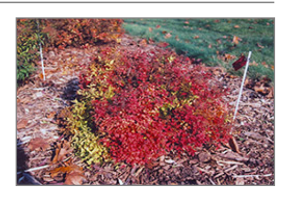
Dakota Goldcharm Spirea in fall

* This is a 'special order' plant - contact store for details