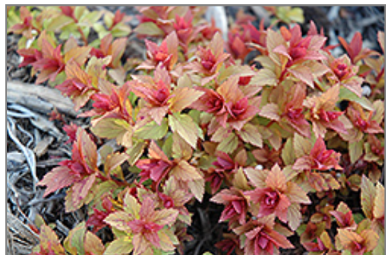
Magic Carpet Spirea foliage