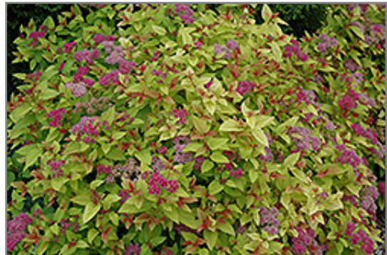
Magic Carpet Spirea flowers