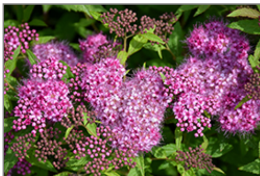
Anthony Waterer Spirea flowers