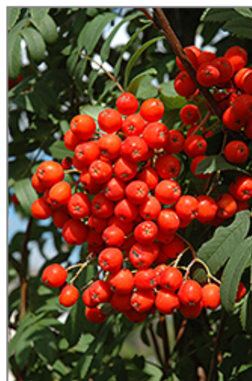
Pyramidal Mountain Ash fruit