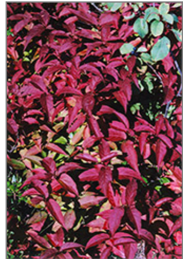
Bush Honeysuckle in fall

This shrub does best in full sun to partial shade. It is very adaptable to both dry and moist locations, and should do just fine under average home landscape conditions. It is not particular as to soil type or pH. It is highly tolerant of urban pollution and will even thrive in inner city environments. This species is native to parts of North America.