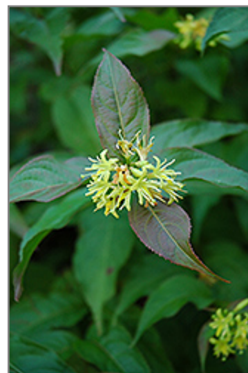
Bush Honeysuckle flowers