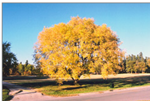
Boxelder in fall