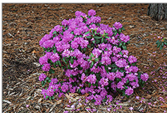
Compact P.J.M. Rhododendron in bloom