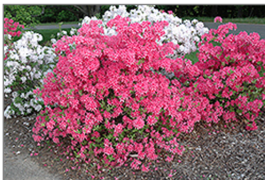
Rosy Lights Azalea in bloom