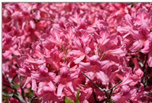
Rosy Lights Azalea flowers