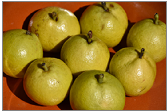
Golden Spice Pear fruit

Golden Spice Pear is smothered in stunning clusters of white flowers with purple anthers along the branches in mid spring. It has dark green deciduous foliage. The glossy oval leaves turn an outstanding burgundy in the fall. The fruits are showy yellow pears with a red blush and which fade to gold over time, which are carried in abundance from late summer to early fall. The fruit can be messy if allowed to drop on the lawn or walkways, and may require occasional clean-up.