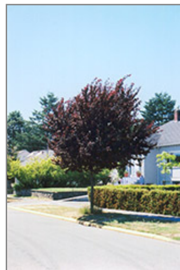
Newport Plum