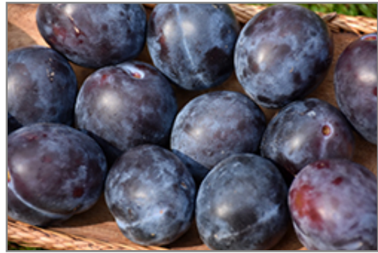
Mount Royal Plum fruit

Mount Royal Plum is draped in stunning clusters of fragrant white flowers along the branches in early spring before the leaves. It has dark green deciduous foliage. The pointy leaves turn yellow in fall. The fruits are showy blue drupes with purple overtones, which are carried in abundance in late summer. The fruit can be messy if allowed to drop on the lawn or walkways, and may require occasional clean-up.