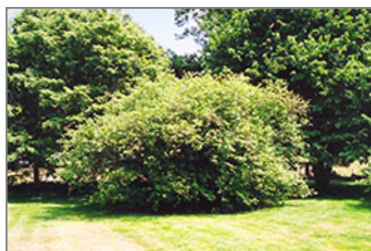
American Hazelnut