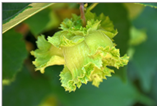
American Hazelnut fruit