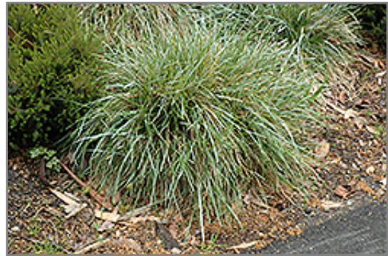
Blue Moor Grass