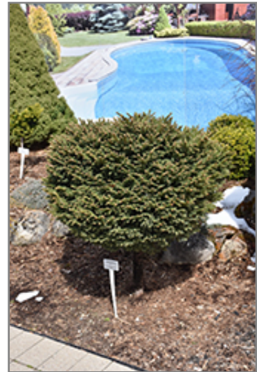
Little Gem Spruce (tree form)

Little Gem Spruce (tree form) will grow to be about 24 inches tall at maturity, with a spread of 24 inches. It has a low canopy with a typical clearance of 2 feet from the ground. It grows at a slow rate, and under ideal conditions can be expected to live for 50 years or more.