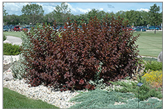
Diablo Ninebark