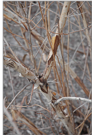
Diablo Ninebark bark

This shrub does best in full sun to partial shade. It is very adaptable to both dry and moist locations, and should do just fine under average home landscape conditions. It is not particular as to soil type or pH. It is highly tolerant of urban pollution and will even thrive in inner city environments. This is a selection of a native North American species.