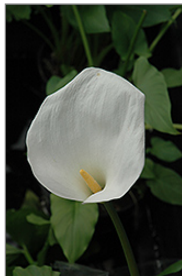
Calla Lily flowers